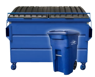
BLUE = RECYCLABLES

Items going in the ORGANICS cart or bin should be free of glass, metal, and plastic.