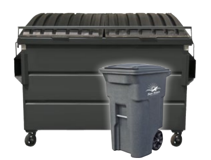
GRAY = GARBAGE