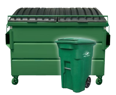
GREEN = ORGANICS